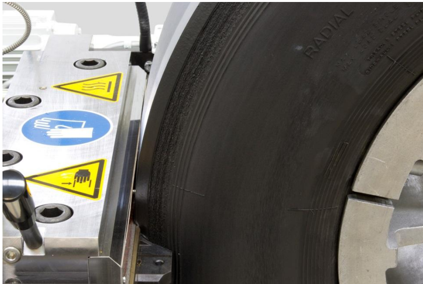
Cushion Gum Extrusion

The variable speed on the extruder drive, together with the adjustable hub speed, enables get the optimum in output for all tire sizes. This unit is provided with a display on eye level.