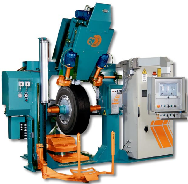
machine complete with computer controlled sidewall brushing assembly

MACHINE SUITABLE FOR TRUCK TYRES UP TO 445 R 22.5" AND 495/45 R 22.5"